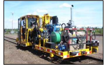
Nordco CX Hammer

Nordco has developed improved Workhead Plates for the CX Hammer that reduce machine downtime by increasing the life of the Guide Rod. The depth has been increased on the portion of the Workhead Plate that houses the bushing, making it possible to accept a longer-lasting 5.5" Bronze Bushing and 20" Stainless Steel Guide Rod. The Workhead Plate has also been reinforced for greater durability. IMPORTANT: To ensure proper operation, do not use the standard 18" Guide Rod (65636100) with these Workhead Plates and 5.5" Bushing.