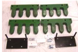
GRIPPER STORAGE KIT