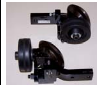
GAGER BUGGY WHEEL RH (TOP) & LH (BOTTOM)