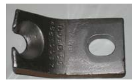
CLAW PULLER SINGLE

STANDARD PULLING HEAD MAINTENANCE 93351153L LH SPIKE PULLING ASSY. W/NEW TOGGLE SLIDE PLATE 93351153R RH SPIKE PULLING ASSY. W/NEW TOGGLE SLIDE PLATE 96090339 LS PULLING FRAME ASSY. 96090390 CLAW HSG HD TOGGLE SLIDE ASSY. 46650037 CLAW PULLER SINGLE 46650038 CLAW PULLER DUAL 67271851 ADJUSTING LINK 66067030 TOGGLE ROD EYE 66068232 TOGGLE ROD EYE 98350044 CLAW LOCK-UP ASSY.