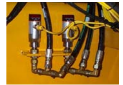
PRESSURE SWITCH UPGRADE KIT

98760246 CAB WINDOW SHADE KIT 98760036 TIE INSERTION STOP KIT 98760059 CAB TUBE UPGRADE KIT 98760061 PROPEL SWITCH FOOT GUARD KIT 98760062 PRESSURE SWITCH UPGRADE KIT 98760067 SUSPENSION ARM LOCK KIT