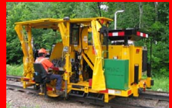
ANCHOR APPLICATOR E & F