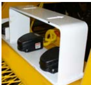
FOOT SWITCH W/MTG BRKT