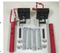
CLAW LOCK-UP ASSY.

LEWIS PULLING HEAD MAINTENANCE 46650070 LEWIS BOLT PULLER CLAW 66067034 ROD END TOGGLE 66068234 ROD EYE TOGGLE 67271853 ADJUSTING LINK - LEWIS BOLT 98350045 CLAW LOCK-UP ASSY.