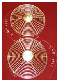
DUAL CONDENSER GUARD KIT