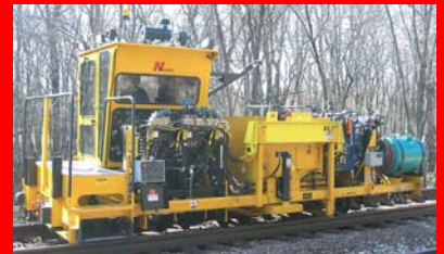
BAAM ANCHOR APPLICATOR