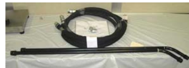
CAB TUBE UPGRADE KIT