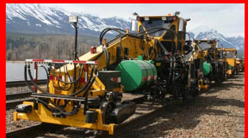
TRIPP TIE EXCHANGER