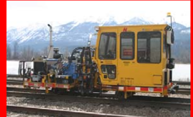
SP2R, GRABBER & SUPER CLAW