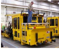
BULKLOADER WALKWAY KIT