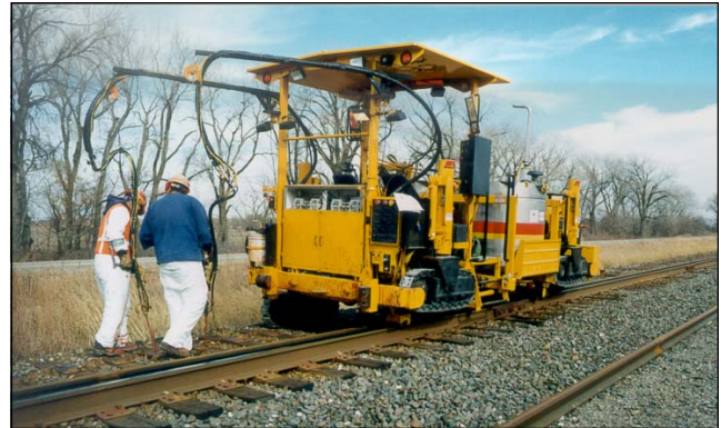
Nordco NETP Epoxy Tie Plugger

This kit provides easy access to the crawler grease port on the Nordco NETP Epoxy Tie Plugger. This simplifies and speeds up the greasing operation. The kit includes greasing hose with fitting and 90-degree elbow.