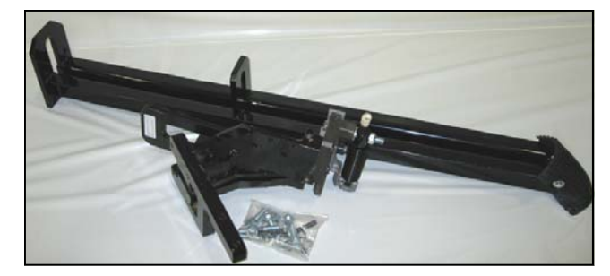
Bolt-On Spike Tray Assembly.