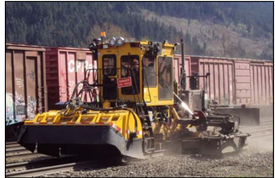
Nordco M7 Ballast Regulator/Snow Fighter.

This kit provides a machine-mounted, 24V compressed air supply for regular maintenance purposes such as cleaning the radiator and general machine cleaning. It can also be used for used to power air tools when used for light maintenance.