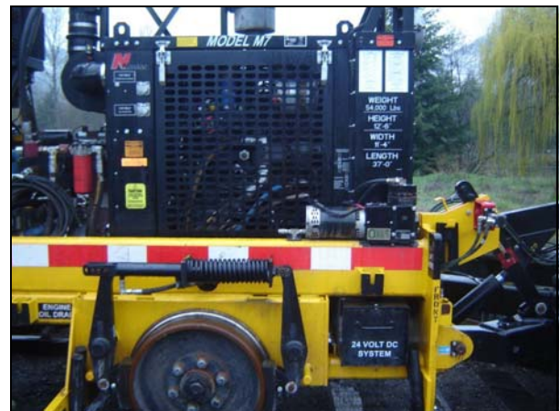
98800017 Air Compressor Kit, close-up and mounted on machine.

Contact Nordco for use on machines other than the M7.