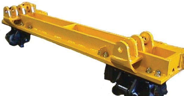
J0-2201685-2-01: Rebuilt Roller Clamp Assembly Complete