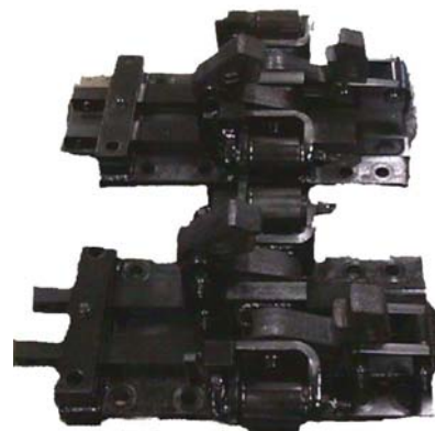
JW683484LEX: Exchange Rail Clamp Assembly (Left)