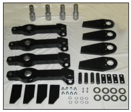
98760475 Brake System Upgrade Kit for TRIPP.