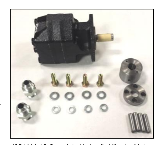
J251414-1C Complete Hydraulic Vibrator Motor includes all components required for installation.

Nordco offers a wide selection of Jackson 6700 parts and kits, ready for fast delivery. Contact Nordco for more information or visit the Parts section at www.nordco.com.