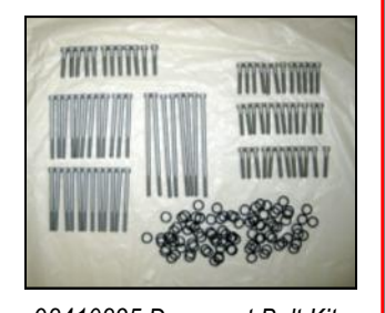
98410835 Dacromet Bolt Kit for CX Hammer.