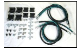
98410320 Spike Feed Warm-Up Kit.

98410320 Spike Feed Warm-Up Kit. Helps ensure proper operation of spike feed cylinder in extreme cold by directing a small flow of heated oil to the hydraulic line connected to the cylinder each time it is activated. One kit required for both sides of machine.