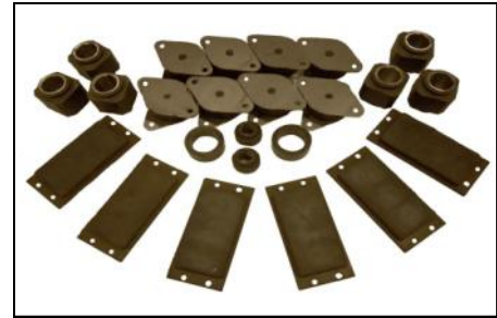
JS100505 Workhead Rubber Replacement Kit.