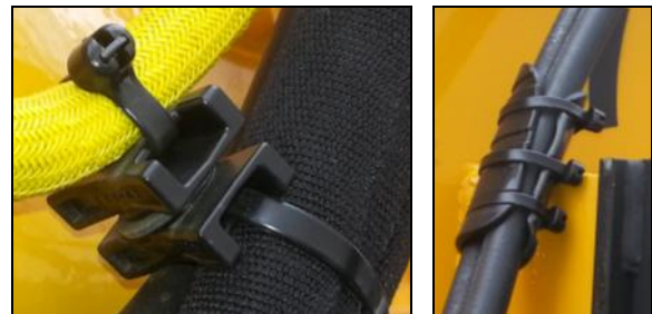
Left: Cable Swivel Mount and Cable Tie. Right: PVC Hose Protector.