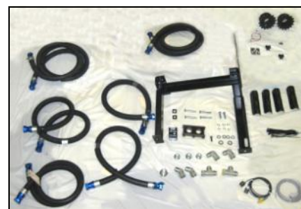
The 98310020 2-Speed Travel Kit includes the manifold and components shown above.

Go to the Maintenance-of-Way Parts section at www.nordco.com for a complete, searchable list of machine parts, kits and exchange components.