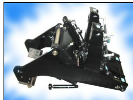
90680022 Jaw/Clamp Exchange.

Complete, preassembled workhead for the Anchor Applicator - F. One workhead per machine. Here's how the Exchange Component Program works: Send in your old, worn-out unit, and receive a like-new refurbished replacement with full factory warranty. Nordco offers an extensive selection of Exchange Components. Contact Nordco or visit www.nordco.com for more information.