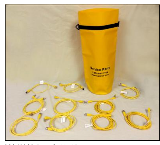
98840009 Prox Cable Kit.