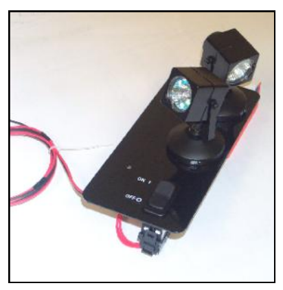
98760056 Interior Cab Lighting Kit.

The interior cab light provides an adjustable light source. The unit includes two 5-Watt halogen lights on swivel mounts. Operators can direct the light to wherever it is needed. The unit's heavy duty construction is designed to withstand machine vibration during work and travel. Includes light and installation instructions.