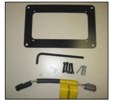
Above 98410271 Dome Red /White LED Lamp Kit installed; installation components included with kit.