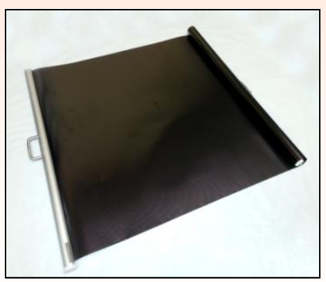
Polyester Film Sun Shade.

98650034 Extended Cab - AA2R, RPI: (1) Front, (2) Front LH & RH, (3) Rear, (4) Door & Side Small, (2) Side Large