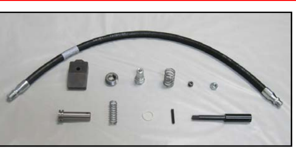
98690037 Anchor Holder Maintenance Kit.

Can be used with: BAAM Anchor Applicator All serial numbers with Unit 5 Tooling What it does: Convenient selection of parts frequently used in repair and maintenance of Unit 5 Anchor Tooling. Description: Kit includes one each of the following: Part # Description 3605901 Compression Spring, .845OD 1.5L 58413795 Anchor Holder Plunger 35702078 O-Ring 11/16 X 7/8 1559924 Pipe Plug 3/4 CSK 18780310 Unit 5 Anchor Gripper Block 3384191 Spring Pin .188 X 1.250 54030295 Anchor Spring Cushion Pin 3604395 Compression Spring 3042020 Hex Locknut 3/8-16 1559440 Pipe Plug 1/8 Countersunk 44251536 Hose Assembly 10286150 Male Disconnect, 1/4 NPTF