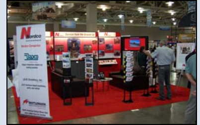
Nordco is a familiar sight at many industry events.

The Nordco family of companies will be well-represented at the 2011 National Railroad Construction and Maintenance Conference and Exhibition in Fort Lauderdale, Florida. If you are attending the conference, be sure to visit us at Booth 201 to learn more about our full range of capabilities, including aftermarket parts and kits. The event takes place January 5th through 8th at the Marriott Harbor Beach Resort.