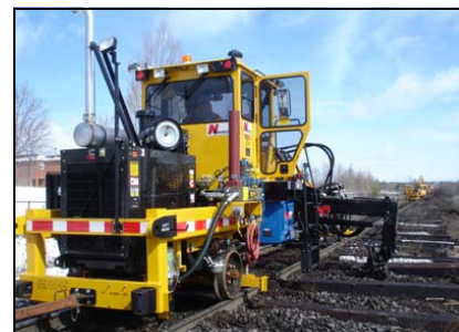
Nordco TRIPP Tie Exchanger.

Description: Complete, preassembled TRIPP workhead with gripper assembly. Two workheads required per machine.