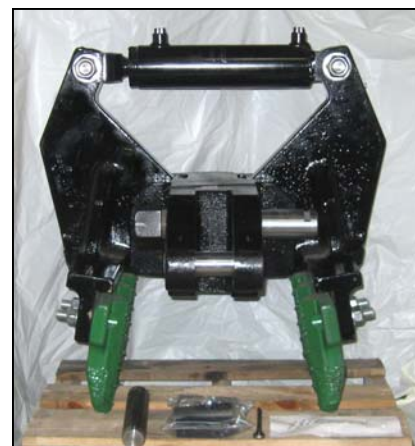
98760054 TRIPP Workhead Kit.

For a complete list of machine kits, go to Parts at www.nordco.com and click on Search for Repair and Upgrade Kits .