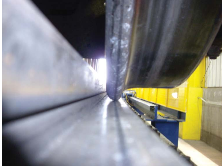
Section of flange-bearing track

Provides real-time assessment of wheel flaws.