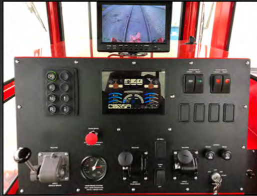
180 degree rotating console with multifunction display. Dual four-way air suspension seats for operation from either side of cab when in rail mode.