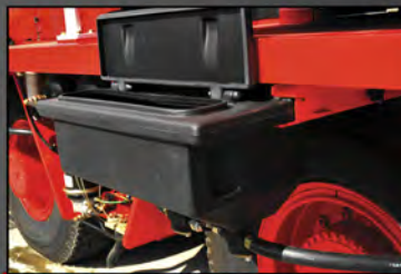
Pull out sander boxes with wide mouth lids for easy loading. Air activated sanders for smooth dispensing.