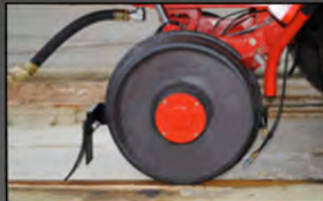
Powerful air knife increases capacities up to 50% in adverse weather.