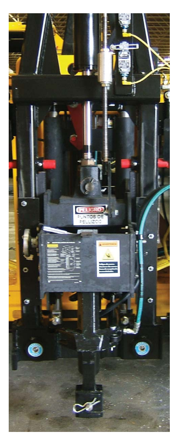
An easy-to-access workhead assembly allows you to quickly perform maintenance or make claw adjustments.