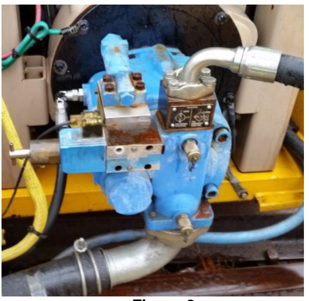
Figure 2 Past PVM-098 pump on CX