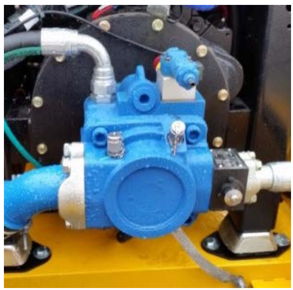
Figure 3 Past ADY-098 pump on CX