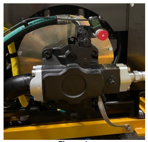
Figure 4 Current Danfoss pump (shown on CX)