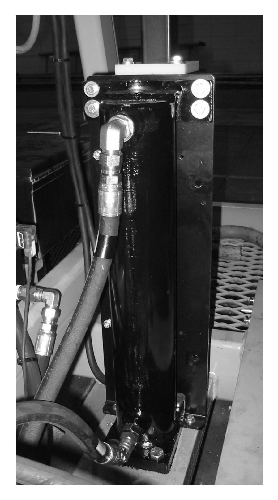
Figure 1 (Machine Lift Cylinder 28552671)