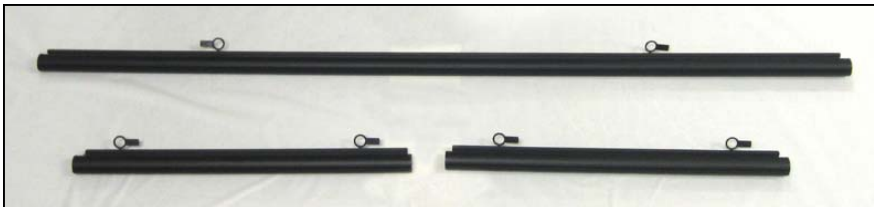
98760246 TRIPP Cab Window Shade Kit. Kit also includes mounting hardware.

Kit also includes all required mounting hardware and installation instructions.