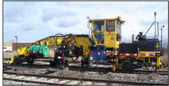
Nordco TRIPP Tie Exchanger.

Shades mount to cab interior wall above windows.