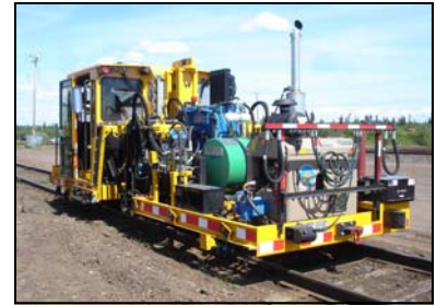
Nordco CX Hammer.

Also used with Nipper Clipper AK-67 with Standard Cab