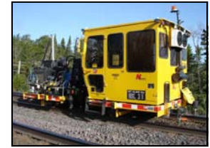
Nordco SP2R Two Rail Spike Puller; Standard Cab (left) and Extended Cab.