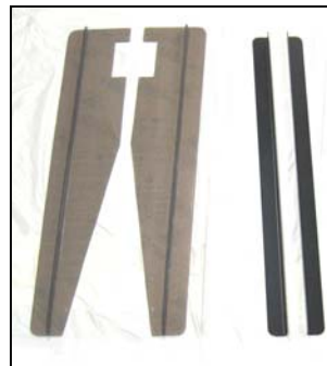
Special reflective outside surface reduces heat and glare.