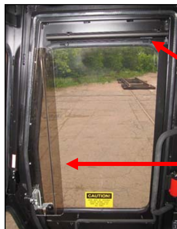
Shade mounted inside cab.