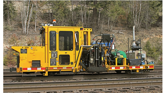
Nordco CX Hammer.