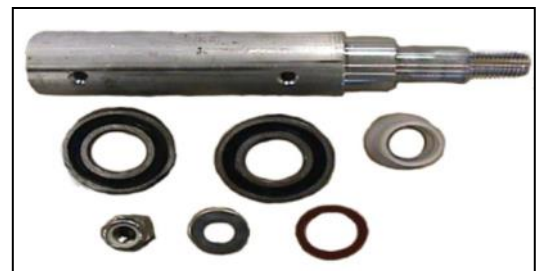
JZ76112-001 Wheel Shaft Assembly.