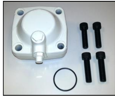
79140945 Accumulator Kit.