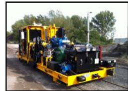
Nordco CX Hammer.