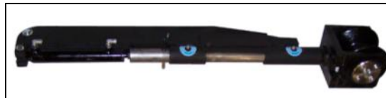
Right: CX Hammer Gun Exchange Assembly. Above: Guide Wheel, included with outside gun assemblies.

Contact Nordco to determine the Gun Exchange Assembly that is right for your application. Nordco offers a wide selection of exchange components for most Nordco maintenance-of-way machines.