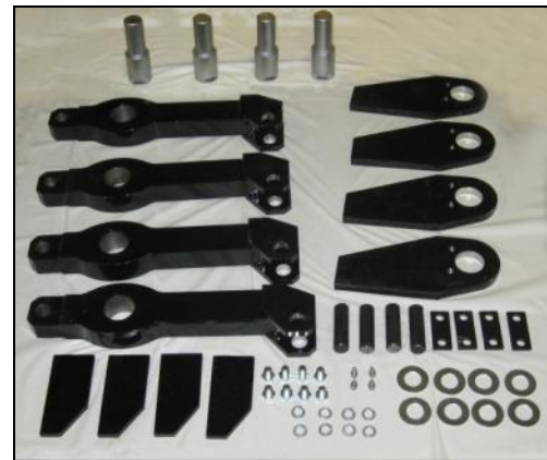
98760475 Brake System Upgrade Kit for TRIPP.