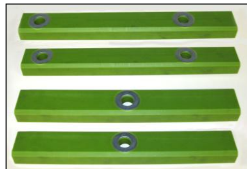
98310116 Workhead Slider Bar Kit for SP2R Spike Puller.