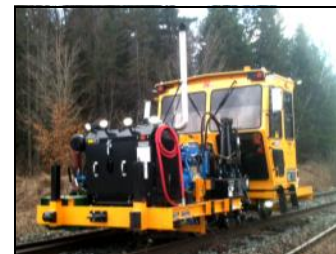
Nordco SP2R Spike Puller.

The 98350129 kit for the Super Claws includes one each of the upper and lower guide blocks.