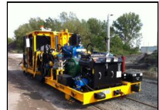
Nordco CX Hammer.