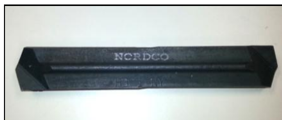
Top: 17723845 1" Double End Drill Bit. Right: Bit cutting surface.