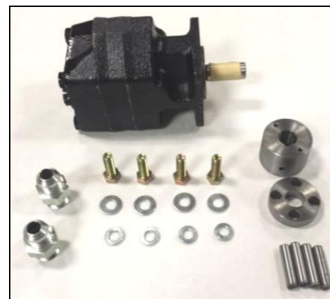
J251414-1C Complete Hydraulic Vibrator Motor includes all components required for installation.

Kit includes installation hardware. Motor and other components can also be purchased individually.