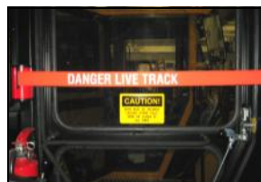
From left: 98760031 Rail Clamp Lever Bushing Kit with Roller; 7550300 Retractable Live Track Belt.