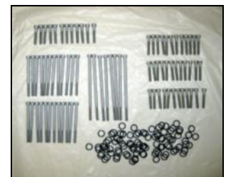
98410835 Dacromet Bolt Kit for CX Hammer.