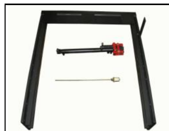
90690124 BAAM Workhead Assembly. Pictured at left is frame with hydraulic components, and at right, workhead.