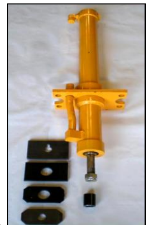
JB5761XAA-KIT Tamper Lift Cylinder Kit.

Go to the Maintenance-of-Way Parts section at www.nordco.com for a complete, searchable list of machine parts, kits and exchange components.