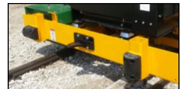
Left: 98840012 Dock Bumper Kit. Right: Bumpers installed on SP2R Spike Puller.