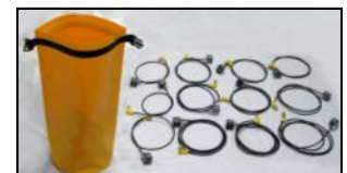
98840001 DIN Cable Kit.

Nordco has introduced an Expanded Din Cable Kit that includes six longer-length cables. Both kits include a selection of DIN Cables stored in a water-resistant nylon dry bag. 98840001 DIN CABLE KIT includes 3 each of 24", 36", 48" and 72" DIN Cables. 98840018 EXPANDED DIN CABLE KIT includes the above plus quantity 3 each of the 96" and 120" DIN Cables. Both DIN Cable Kits and the 98840009 PROX SWITCH CABLE KIT now include quantity 50 of 8" nylon tie-down straps. This helps ensure that tie-downs are available when a cable is replaced.