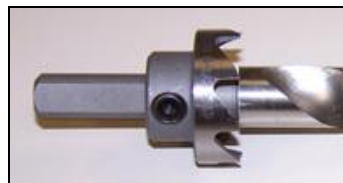
Above: 17721530 Tie Borer Bit 11/16". From left: 17721540 Counter Bore Bit and Counter Bore Bit attached to the Tie Borer Bit shaft.