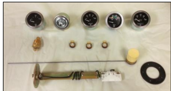
98410279 Operator Panel Gauge Kit.

Part number: 98410279 Can be used with CX Hammer; SP2R Spike Puller; BAAM Anchor Applicator; NETP Tie Plugger; Adzer; TRIPP Tie Exchanger All with gauges. What it does: Convenient selection of gauges and related control panel components used in many Nordco MOW machines.