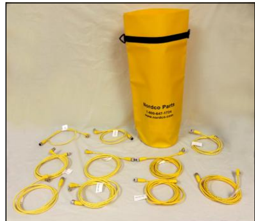
98840009 Prox Cable Kit.

Part number: 98840009 Can be used with Most Nordco Maintenance-of-Way Machines What it does: Provides selection of frequently used Prox Cables in various lengths, on hand when you need them. Description: Kit includes the following components, stored in durable, water-resistant Dry Bag.