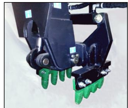
Top: Nordco TRIPP Tie Exchanger. Middle: Complete TRIPP Remover with Gripper Assembly. Bottom: Close up of Gripper Assembly.