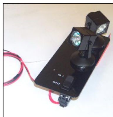
98760056 Interior Cab Lighting Kit.

The interior cab light provides an adjustable light source. The unit includes two 5-Watt halogen lights on swivel mounts. Operators can direct the light to wherever it is needed. The unit's heavy duty construction is designed to withstand machine vibration during work and travel. Includes light and installation instructions.