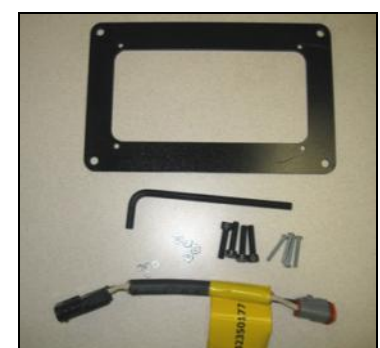
Above 98410271 Dome Red /White LED Lamp Kit installed; installation components included with kit.