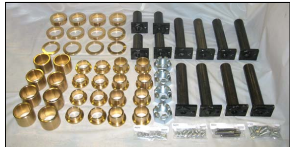
98410204 Gager Overhaul Kit, Non-Insulated.