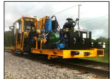
Nordco CX Hammer.