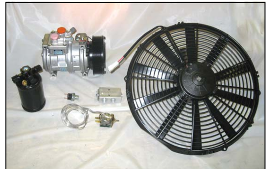
98410496 Air Conditioner Maintenance Kit.

For a complete list of machine kits, go to Parts at www.nordco.com and click on Search for Repair and Upgrade Kits.