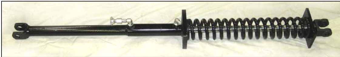
96350760 Brake Cylinder Assembly.