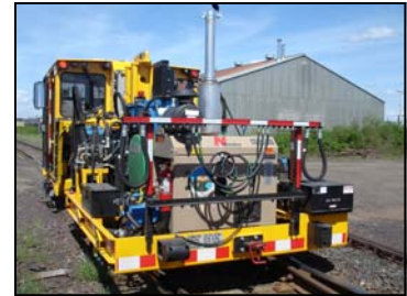
Nordco CX Hammer.

Description: 96350760 Brake Cylinder Assembly includes 28551843 Cylinder; 3627950 Compression Brake Spring and all required hardware in preassembled unit. 98410528 Cobra Brake Kit Assembly includes the above, plus quantity 2 47881298 Brake Lever; 21800097 Brake Head; 70900075 Cobra Brake Shoe; and all required hardware, preassembled and attached to the Brake Cylinder Assembly.