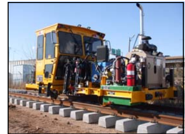
Nordco NSCA Spring Clip Applicator.

Kit also includes wire, ring terminals and 480159 installation instructions.