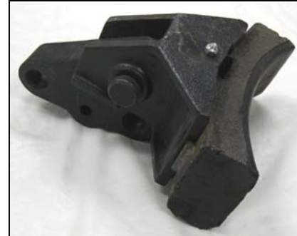
Brake Lever, Brake Head and Brake Shoe are included as part of complete, ready-to-install 98410528 Cobra Brake Kit Assembly.