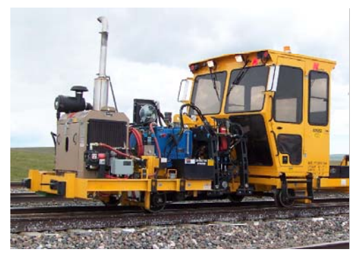
Nordco has developed Spare Parts Packages for the M7 Ballast Regulator/Snow Fighter and the Spring Clip Applicator (pictured above).

Nordco has added to its selection of Spare Parts Packages with the introduction of Basic, Expanded and Fleet packages for the M7 Ballast Regulator/Snow Fighter and the Nordco Spring Clip Applicator (NSCA). The Spare Parts Packages include critical and frequently ordered parts. The M7 and NSCA packages – along with all the other available packages – can be found in the Parts section of the Nordco website at www.nordco.com. For more information contact the Nordco Parts Sales Team at 1-800-647-1724.