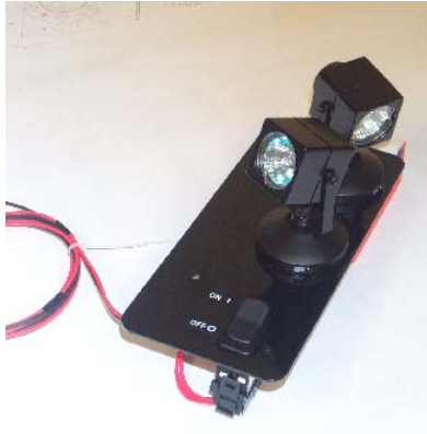
Nordco TRIPP Interior Cab Lighting Kit, 98760056

Featured in next issue: Gager Assembly Kits