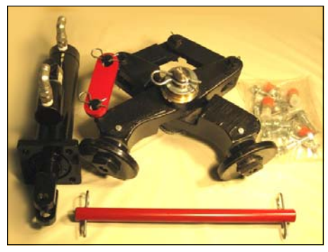
96790052 Rail Clamp Assembly.