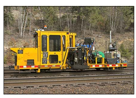
Nordco CX Hammer with Bulkloader.

Part number: 98410550 Can be used with: All CX Hammers with Push Bulkloader What it does Easy and effective way to keep debris, snow and ice out of the bulkloader bin. Description: Heavy-duty vinyl cover with grommets specially designed to fit CX Hammer BulkLoader. Cover secures with rope or bungee cords to completely cover bin. Cover is large enough to allow slight mounding of spikes. Maximum heap load 3 inches above top of bin.