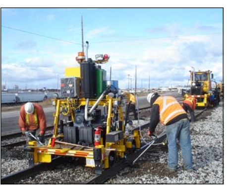
Nordco Auto-Lift Rail Lifter.