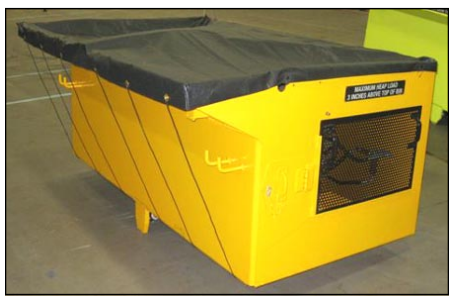
98410550 Bulkloader Cover on bin.