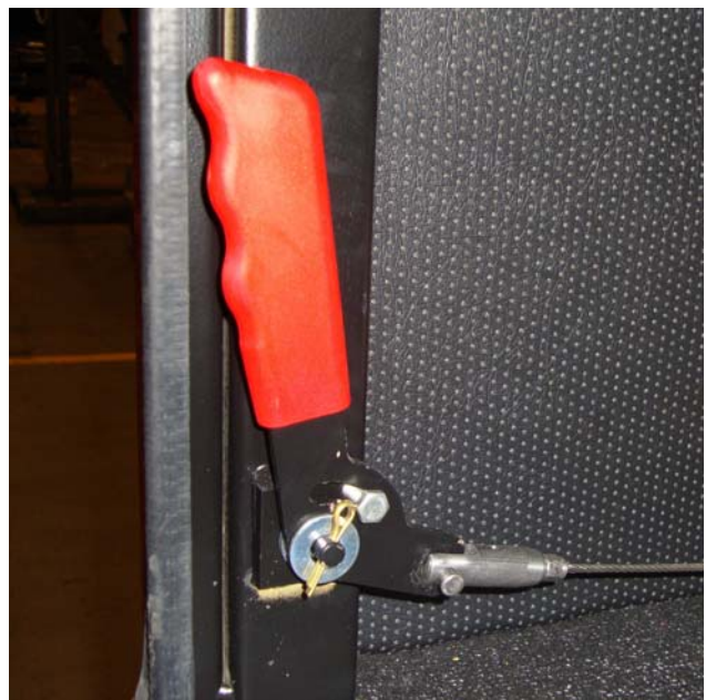
New handle position.

http://www.nordco.com/Customer-Support/Maintenance-of-Way-Equipment/Product-Support-Bulletins.htm