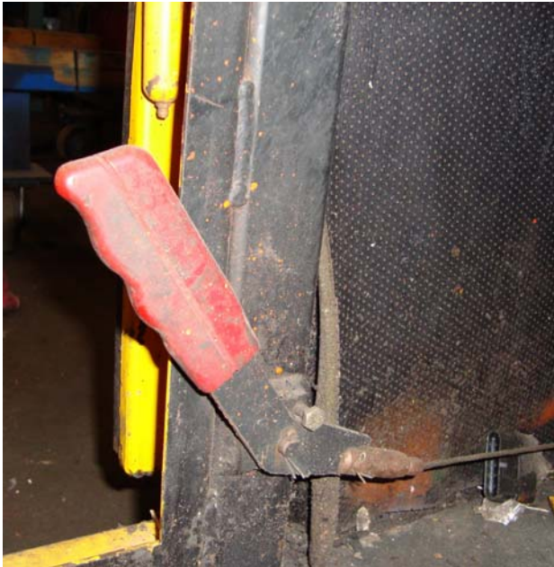
Old handle position.